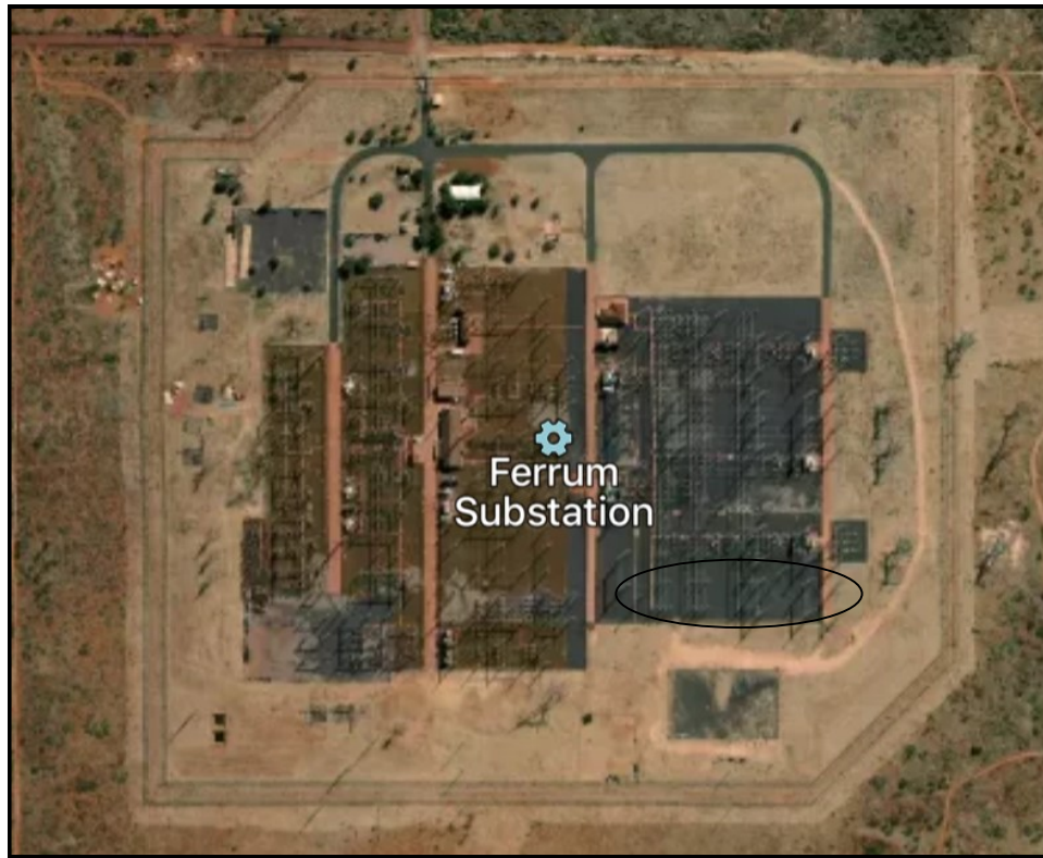
Ferrum Substation Arial View

The scope of work at Ferrum Substation involves a 400kV yard only. The existing buildings are not applicable for this project.