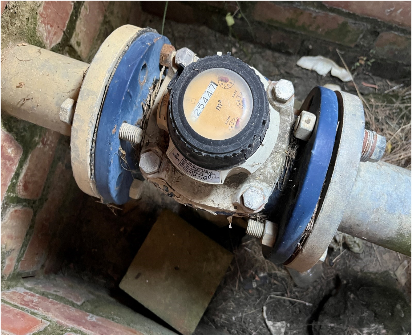
Figure 2 (a) STM Number 147 167