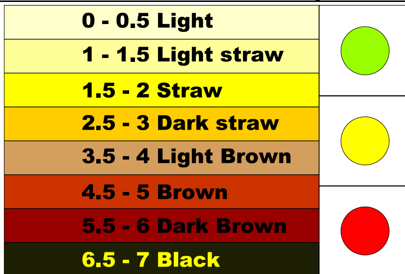
Figure 2: American Standard Technical Method (ASTM) colour codes