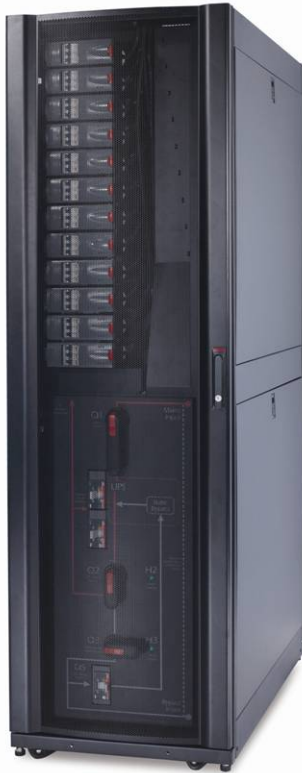
160kW Modular Power Distribution Unit

The APC Symmetra PX 96/160kW with Power Distribution enhances the scalability of the Symmetra PX 96/160 UPS by combining it with APC's uniquely-designed Modular Power Distribution Unit, which enables you to safely expand your power distribution system without hot work and without scheduling downtime.