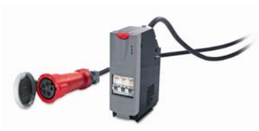
Power Distribution Module

Adding Modular Power Distribution to your Symmetra PX 96/160 UPS has no footprint penalty; batteries are stored in the rear of the PDU, so power protection, distribution, and runtime are provided in the same 1.28 square meters for Symmetra PX 96kW with Modular Power Distribution, or 1.92 square meters for Symmetra PX 160kW with Modular Power Distribution. Symmetra PX 96/160 with Modular PDU delivers the high availability, extreme agility, and low TCO you have come to expect from the Symmetra PX family.