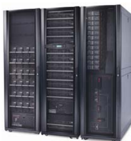
Symmetra PX 160 with Power Distribution