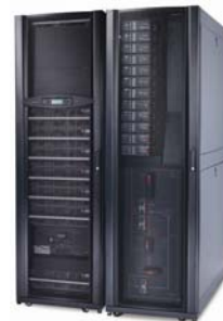
Symmetra PX 96 with Power Distribution

The right-sized UPS for demanding business critical applications