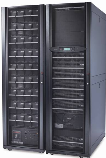
Symmetra PX 96kW

Designed to address the increasing shortage of data center space, the Symmetra PX family serves as the core power train that drives APC InfraStruXure® systems for small, medium, and large data centers. Standardized, factory-assembled modules mitigate the risk of human error during installation or routine maintenance procedures, and with no rear access required, the Symmetra PX 96/160kW fits seamlessly onto the data center floor, into the backroom, or against any wall.