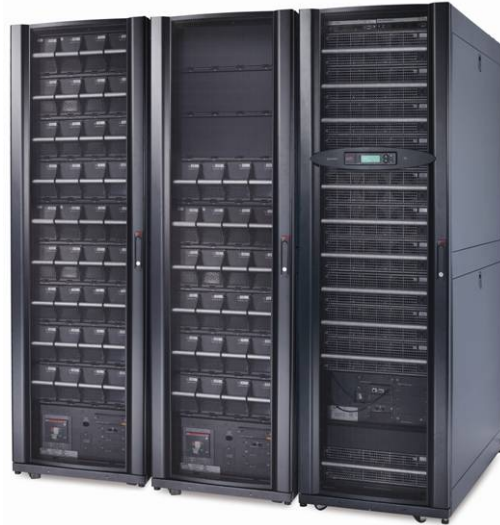
Symmetra PX 160kW

Seamlessly integrating into today's state-of-the-art data center designs, the Symmetra PX 96/160kW is a true modular system. Made up of hot-swappable modules - power, battery, distribution and bypass, this architecture can scale power and runtime in increments of 16kW up to 160kW as demand grows or higher levels of availability are required in your data center. Self-diagnostic capabilities enhance the manageability of the Symmetra PX 96/160kW and increase overall data center reliability.